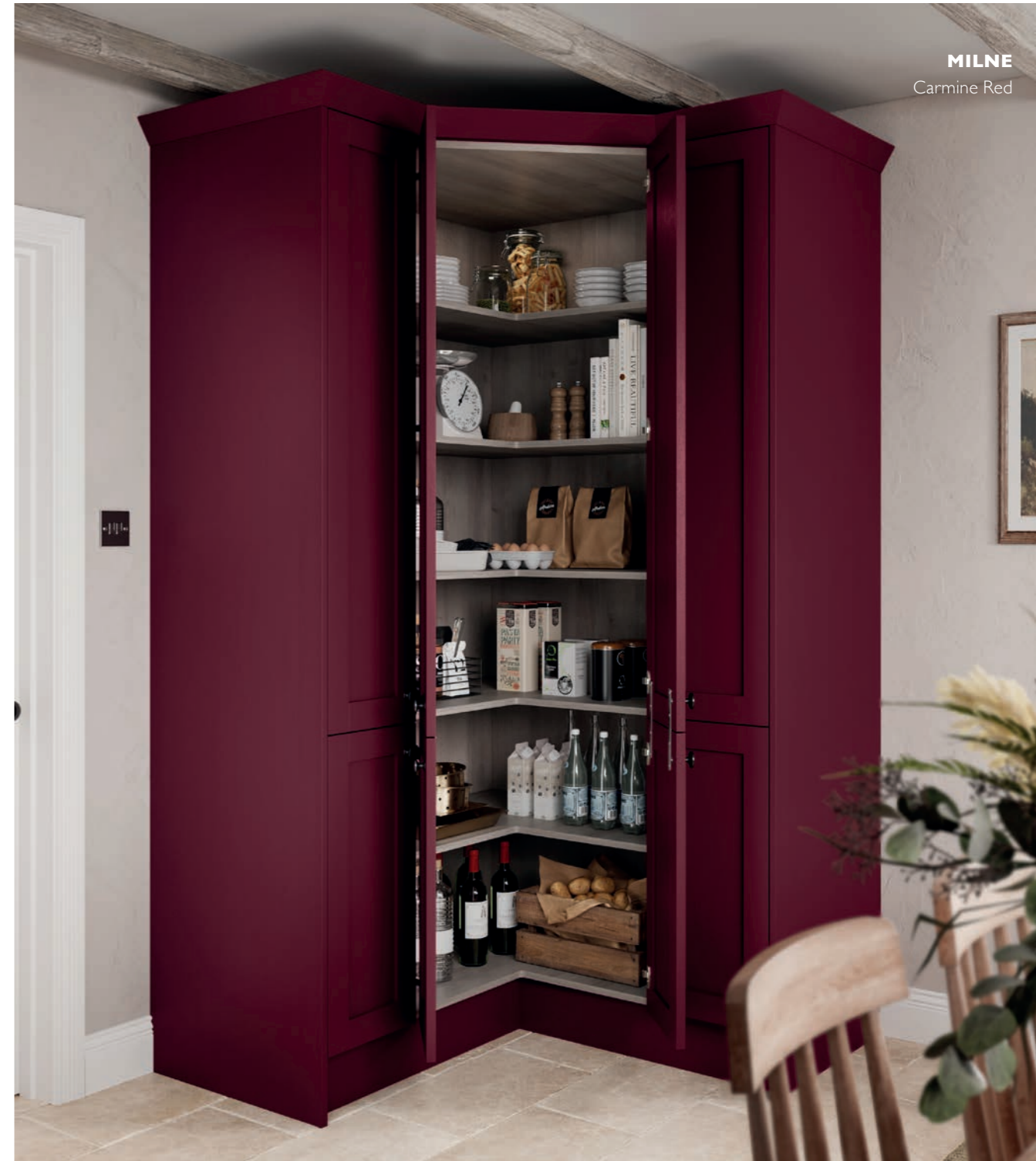
MILNE Carmine Red

Personalise a classic kitchen with a bold colour such as Carmine Red or a more muted tone of Dusky Pink. These colours are ideal to use on islands, mantels or Pantry Larder cabinets.