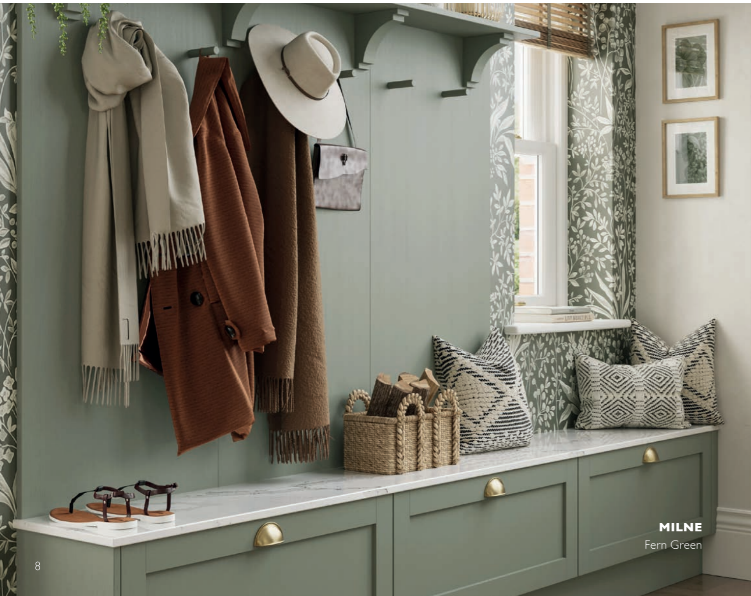
MILNE Fern Green