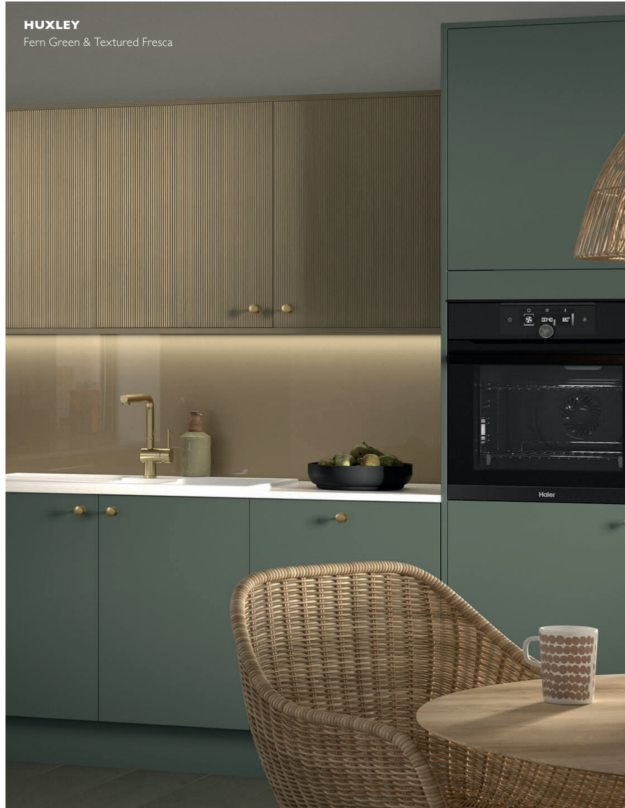
HUXLEY Fern Green & Textured Fresca

The simple vertical reeded pattern is taking interior design trends by storm and adds a layer of texture that elevates a kitchen design into something spectacular.