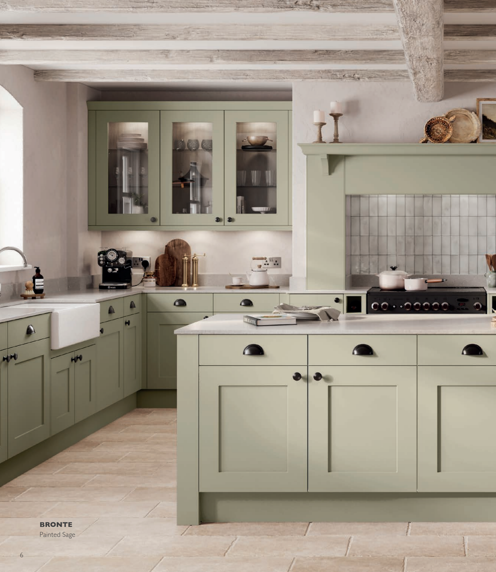
BRONTE Painted Sage