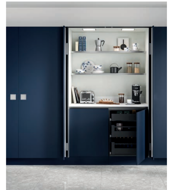
Indigo pocket door pantry.