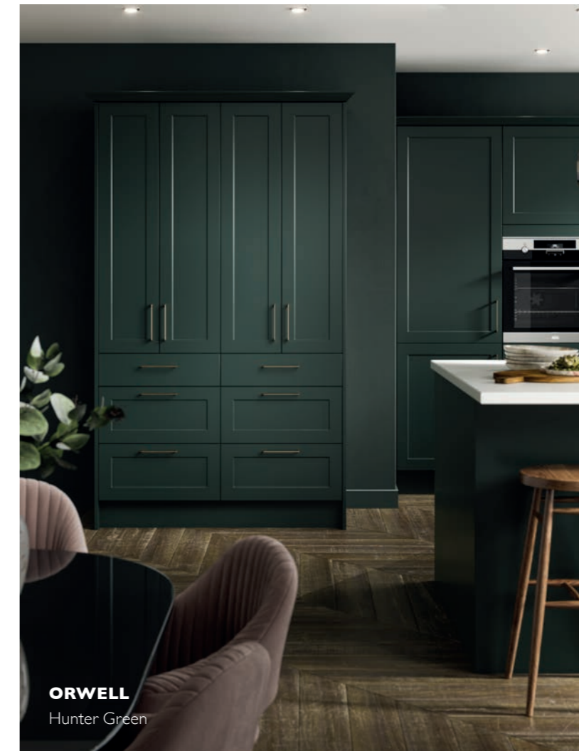
ORWELL Hunter Green

For a more modern take use darker colours such as black and dark greens & blues. Or even add a splash of colour with pinks & reds.