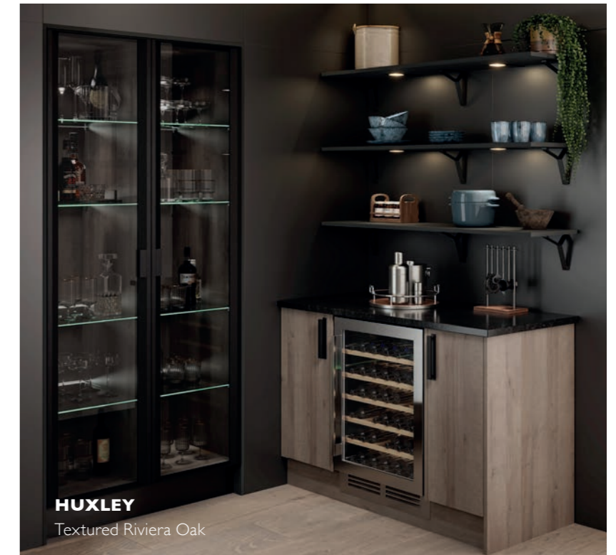
HUXLEY Textured Riviera Oak

Breaking up a kitchen design with the inclusion of glazed doors is a common choice, with the current trend in contemporary designs being black metal glazed doors.