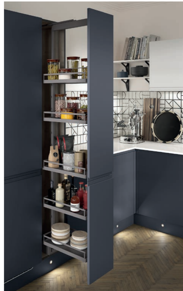
Larder in Matt Indigo with modern anthracite wirework.