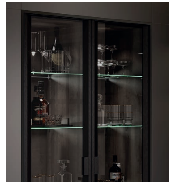
Black glazed door larder with illuminated glass shelves.