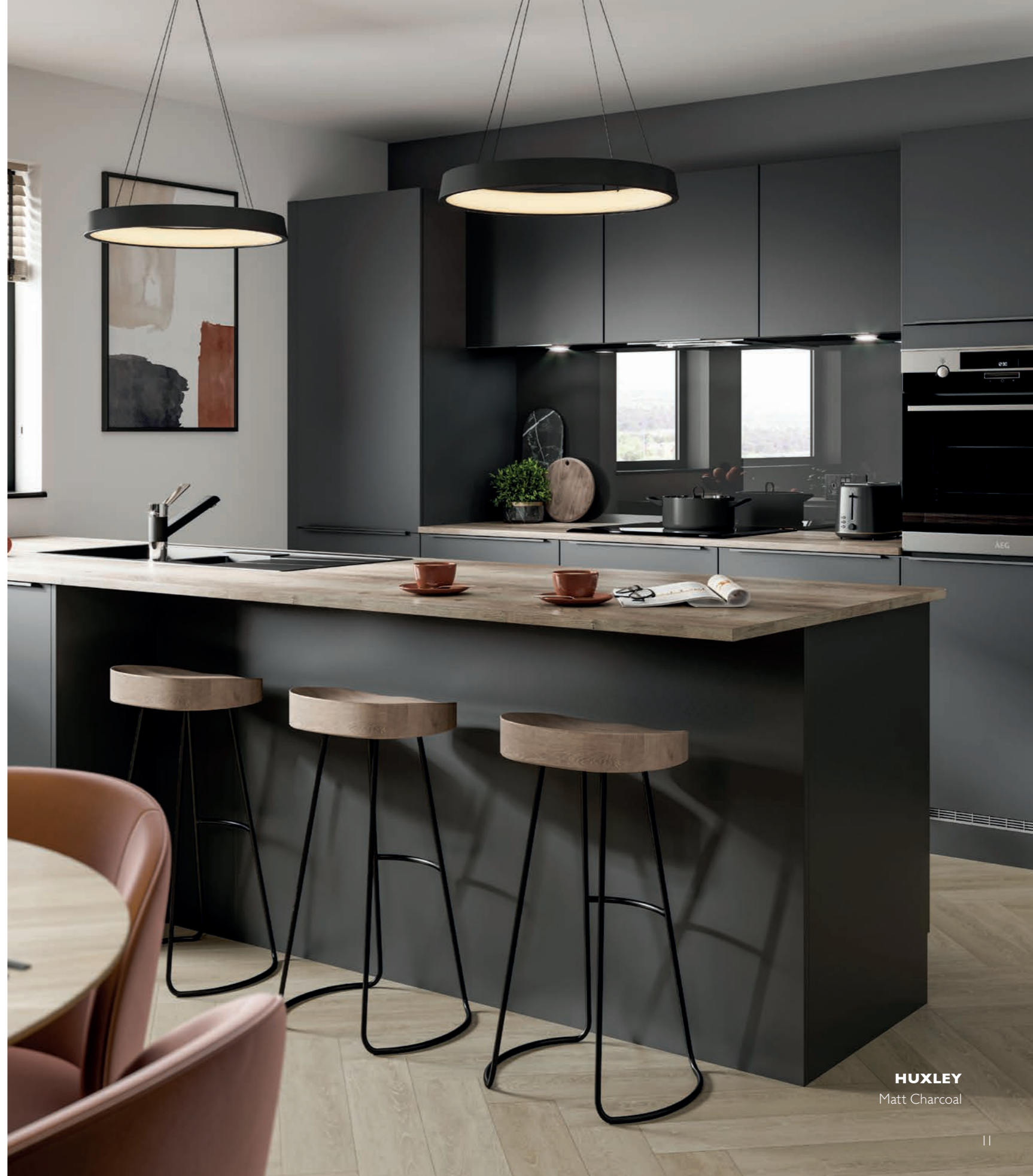
HUXLEY Matt Charcoal