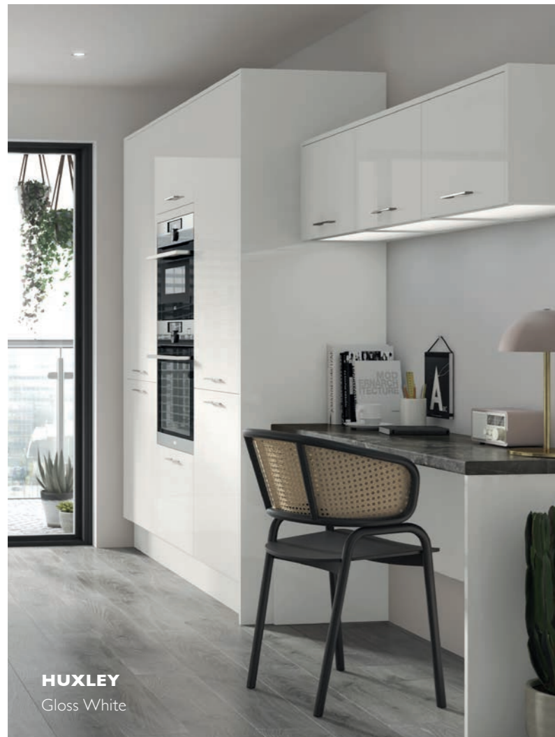
HUXLEY Gloss White

This collection includes the latest trend designs such as elegant Fresca and Noce textured kitchens.