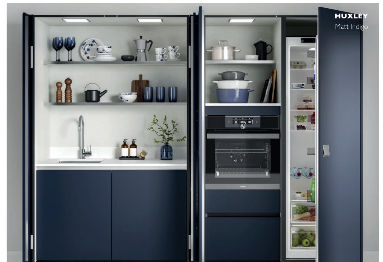
HUXLEY Matt Indigo

With open-plan living continuing to rise in popularity, our range of single and double sliding pocket doors are a great space-saving and aesthetically pleasing solution that suit all different lifestyles.