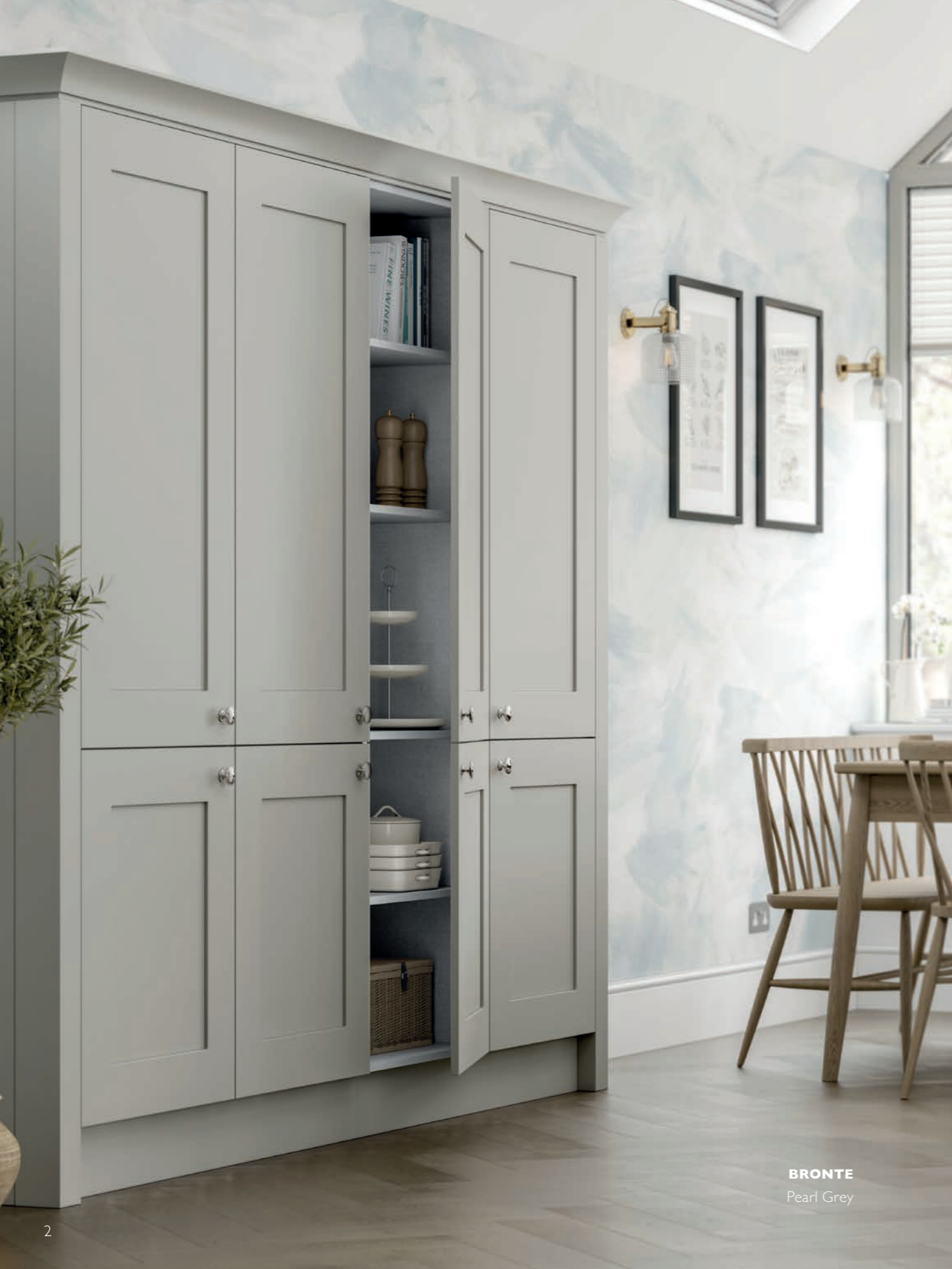
BRONTE Pearl Grey